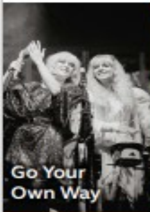
Go Your Own Way